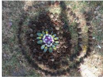
Scarlett 2B - half term project to create a picture using natural objects.